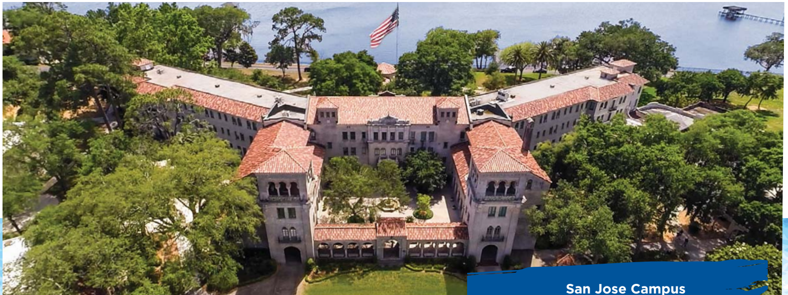
San Jose Campus